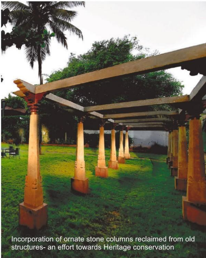
Incorporation of ornate stone columns reclaimed from old structures- an effort towards Heritage conservation