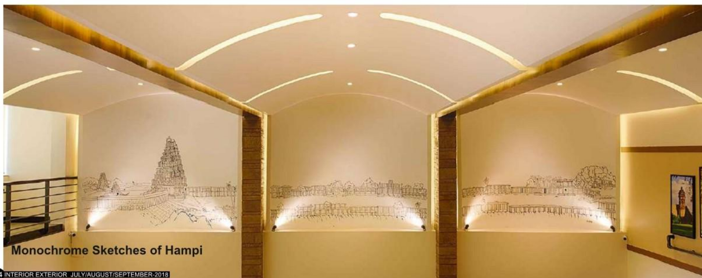
Monochrome Sketches of Hampi

Hotel Priyadarshini- is today a landmark facility at 'Hosapete' as it reflects its cultural context in a subtle way; it's a balanced design evolved out of a meditative attitude towards climate, geography, history, materials, objects and most importantly people. It has responded well to the aspirations of the client, end users-travellers, visitors and locals which is echoed by their optimistic response and feedback. It's a humbling experience for the architects to note that the testimonials given by the guests give evidence of happiness to which architecture and mindful design has made its distinctive contribution.