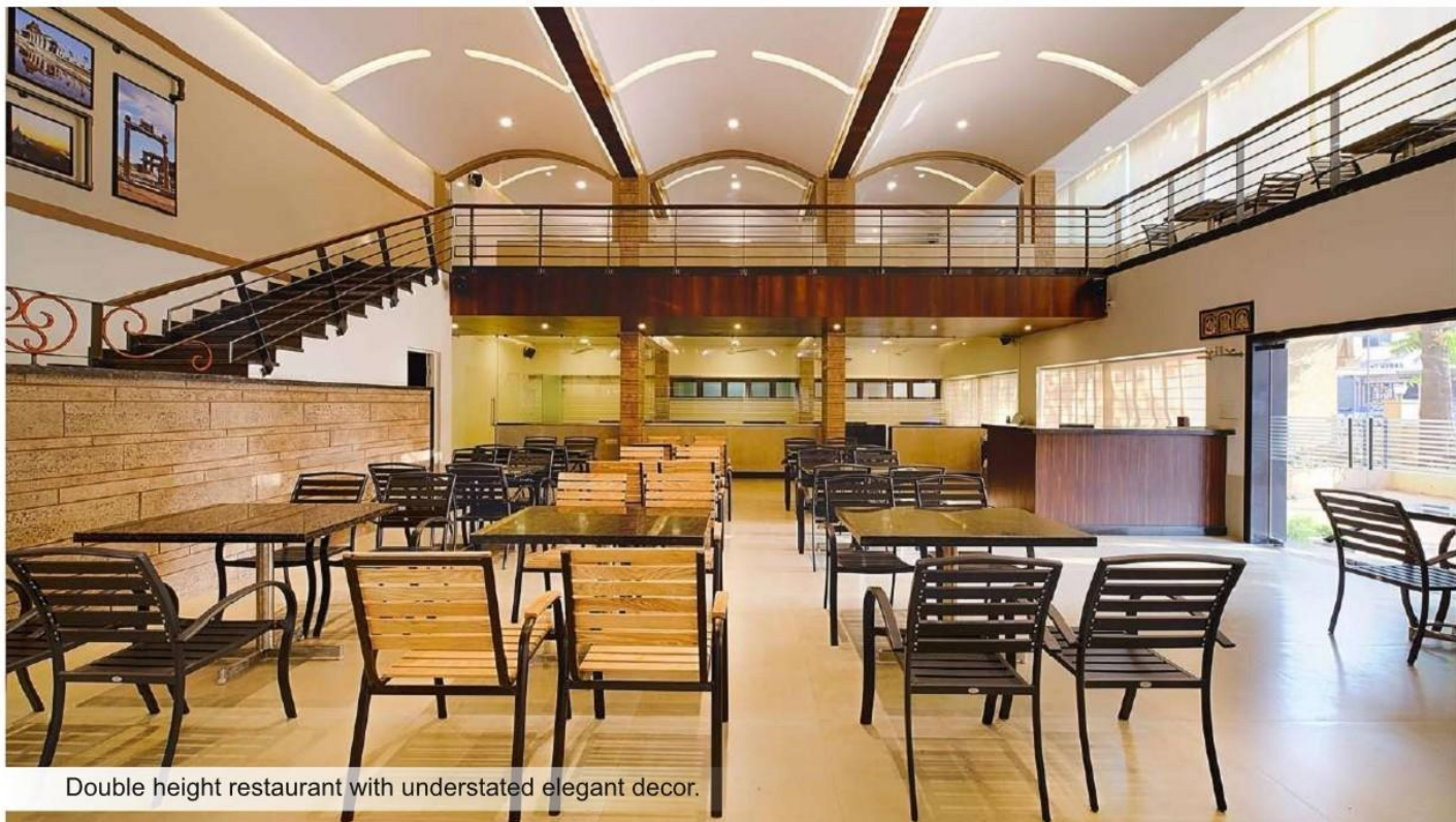
Double height restaurant with understated elegant decor.

The interior design of the new wing was inspired by subtle retro styling to create an exciting experience of freshness, open-mindedness, inventiveness intended at rejuvenating the tourists and travellers. The reception and the waiting lobby witness the arrival of guests who are received at the seamless white corian welcome desk; Soft furnishings infused with neutral colours have been paired with oversized retro inspired luminaires, splash of bright colours here and there, textured walls with patterns to create a laid-back, arty feel. The decor display an eclectic mix of old styles and new forms and finishes; this coupled with the trespligues 'curtains' with pastel colours and retro furnishings and lighting fixtures gives this place the