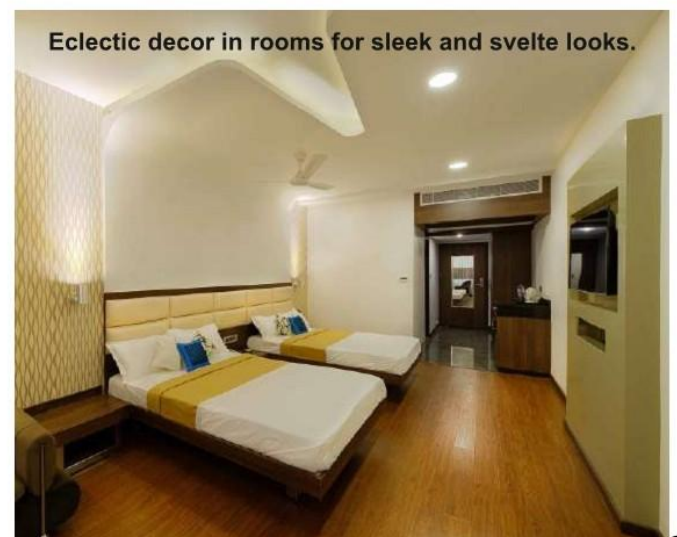
Eclectic decor in rooms for sleek and svelte looks.